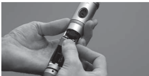
Inserting the battery