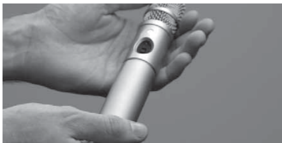
Unscrewing NT3 body